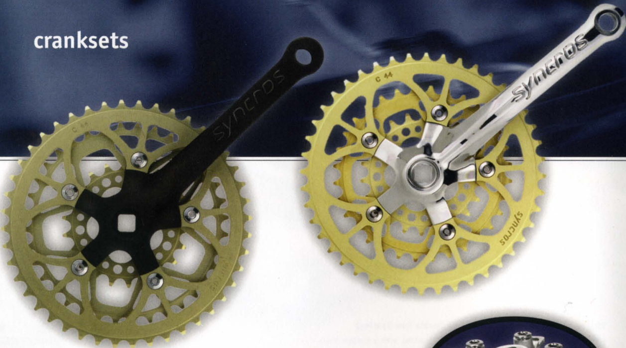
STD™ (Stress Transfer Device) detail