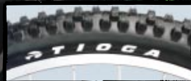
TIOGA FACTORY DH 2.1 TIRES _ OB HIGH PERFORMANCE RUBBER _

Kona Clump 7005 Aluminum tubing _ Four inch Bomber Z4_ Race Face Prodigy Crank with Rock Guard and TruVativ ISIS splined B/B _ 100% ready for the disc brakes of your choice _