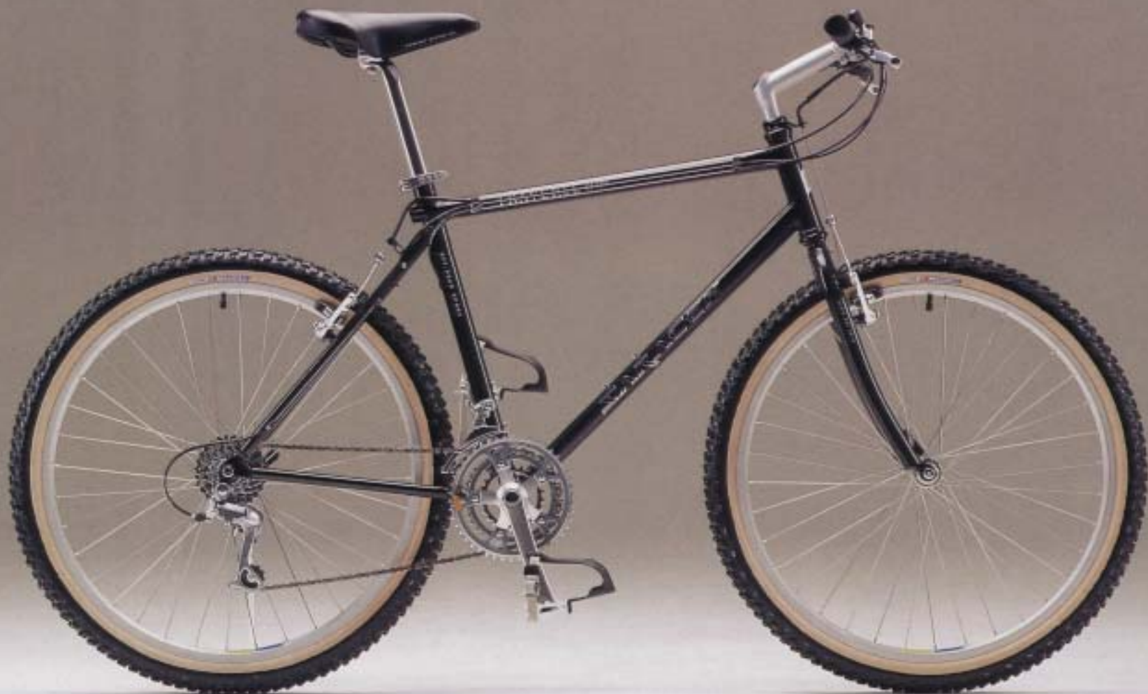
Elliptical Profile Double Butted Frame

Takes the best of the Traverse and upgrades it, adding a Shimano Deore XT Group Set for those who require extensive off-road use and keep coming back for more. The American-made True Temper frame tubing is light but super strong for maximum rider efficiency. Handsome, sleek and ready to race or ride all day, it soaks up the pressures and inspires confidence.