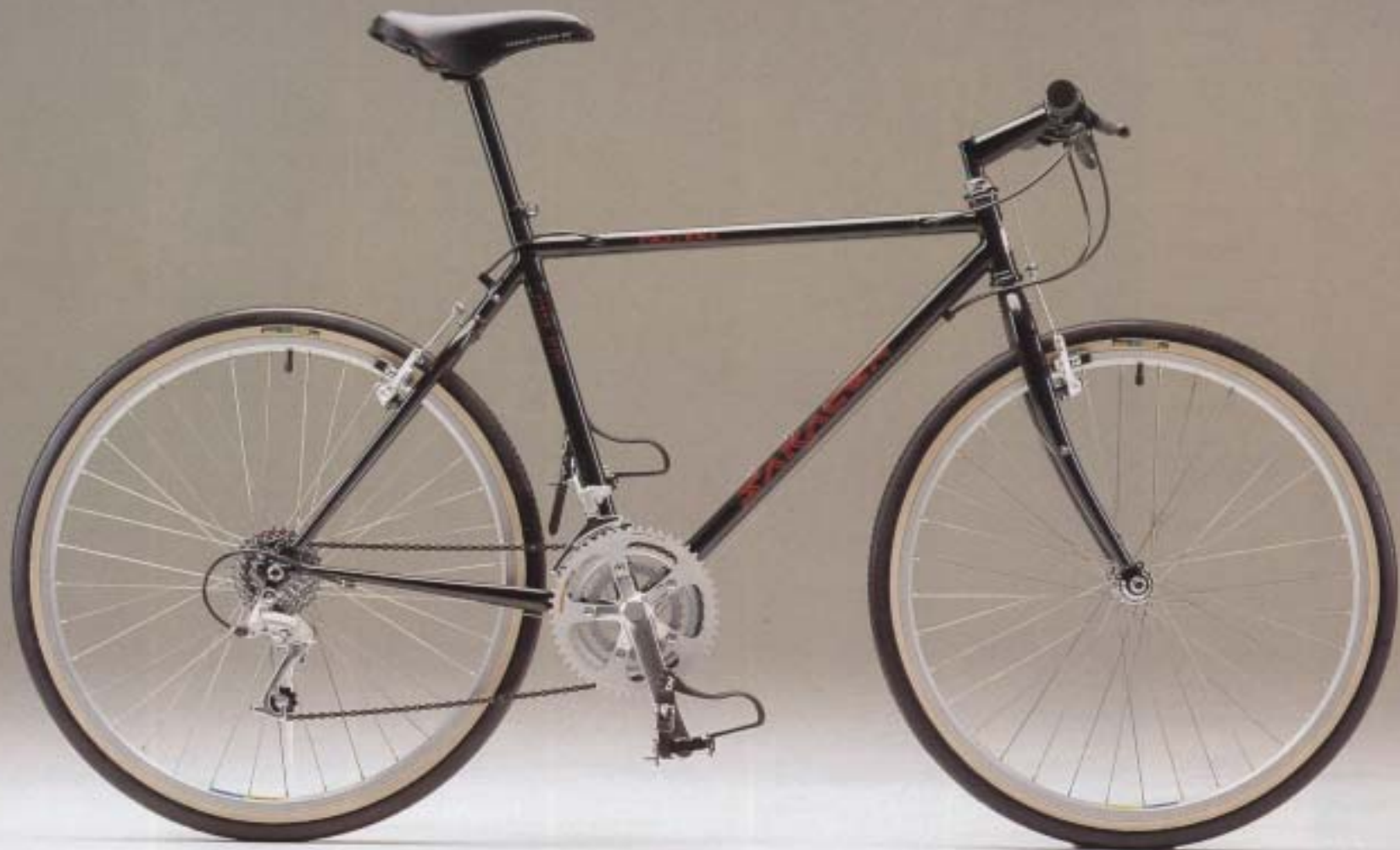
Gripshift - New Gear Shifting System

All-purpose practical hybrid designed to excel in all types of cycling. The Shimano 30-40-50 chain set with round rings combined with a Shimano Deore DX 7 speed 12-28 rear wheel cassette offers higher gearing for energy efficient peddling on the road. New for 1992 is the high quality Shimano 500 CX Group Set, developed specifically for Hybrids. All round top quality components unite for a bike that's light and lively but sturdy enough for multi-sport off-road use.