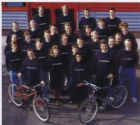
Pictured at our Warwickshire headquarters is the 1992 Saracen workforce. From the accounts department to the salesman, technical staff and mechanics, every member of the entire team has had a significant role in the production of this year's exceptional mountain bike range.

Mountain bikes although tough are not indestructible. Excessively rough use may result in damage to your machine or you - take care and always wear an approved helmet. Optimum riding performance depends on having your bike serviced regularly at your Saracen dealer.