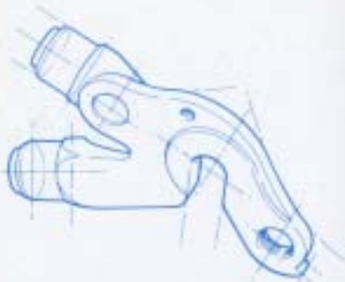
New Investment Cast Lightweight Rear Dropout