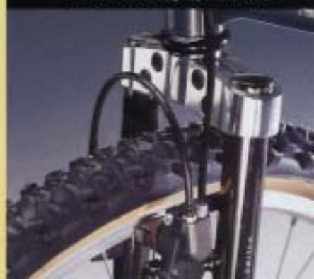
Max Switch Cromoly Super Lite Forks