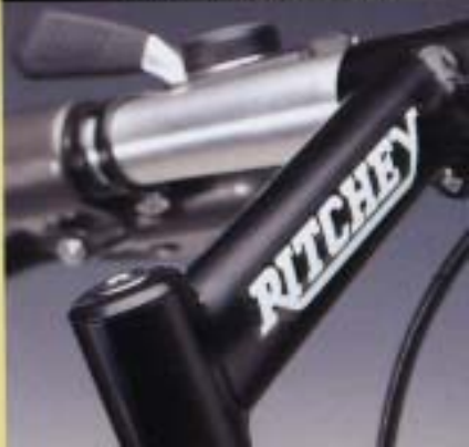
Ritchey Force Lite Cromoly Stem

Good quality Deore componentry for Competition use High strength combined with lightness and increased rigidity at tube joints Increased mud clearance, shorter rear triangle for enhanced climbing, eliminates chain suck and chain bounce Upgraded positive and precise gear shifting, with friction option Precise braking control Sealed for life - maintenance free Strong lightweight competition stem (340 grams) Strong lightweight competition bars (180 grams) Giving alternative hand position especially useful for climbing Lightweight competition rim with double skinned V cross section for increased rigidity (415 grams) Latest Ritchey competition tyres for ultimate Off Road traction (590 grams) New lightweight competition saddle Extremely durable knock resistant finish that doesn't flake if scratched Ensures perfect componentry setup, double checked before leaving the factory, resulting in the lowest warranty claims in the industry Built tighter and stronger than machine built wheels, resulting in increased rider performance