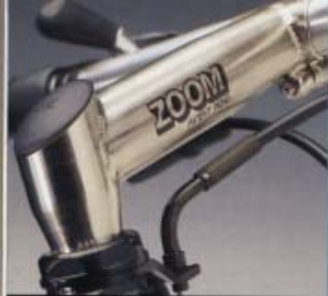
Zoom Lite Stem