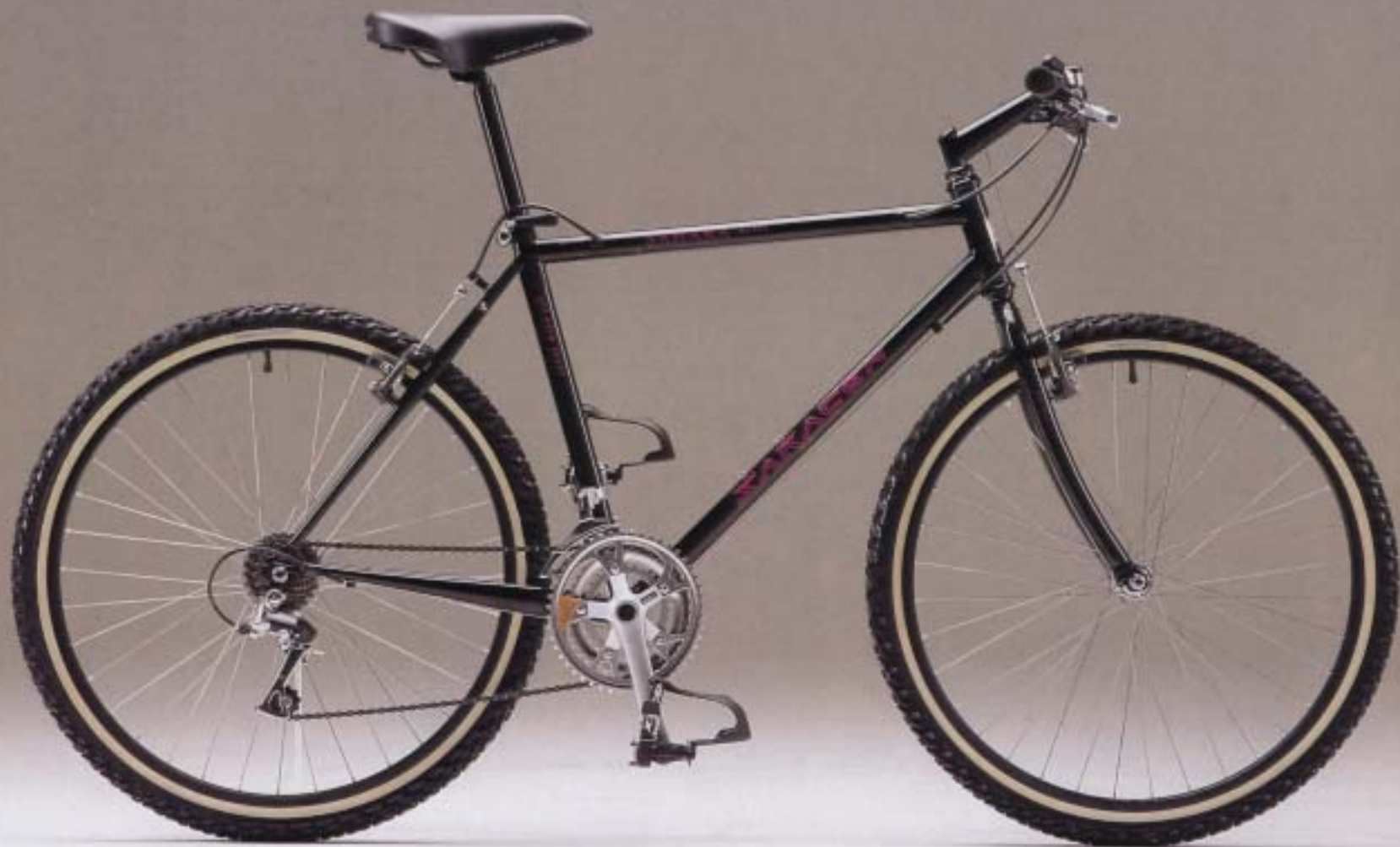
Shimano Deore DX Top Shifters

The full oversize frame in Tange cromoly double butted frame tubing combined with upgraded Shimano Deore DX top shifters, which put the gear shifters right where you need them, and the Shimano Deore DX 2 finger brake levers for smooth, reliable, powerful braking will appeal to the rider who's looking for a better-than-average entry-level machine.