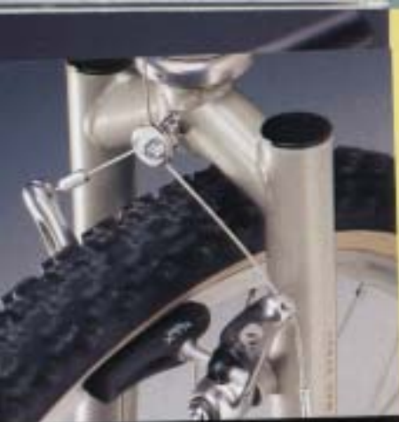
Tange New Lite Strut Fork