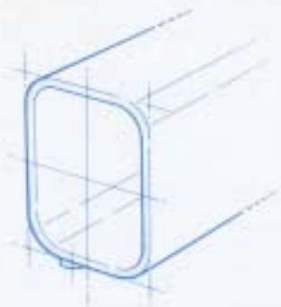
Aluminum Quad Profile Tubing