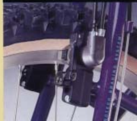
Magura Hydraulic Braking System

Dish lighter and stronger than machine built wheels, resulting in decreased rotating weight and increased rider performance