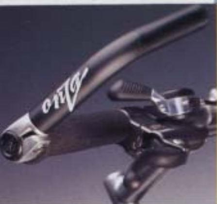
Onza Alloy Bar Ends