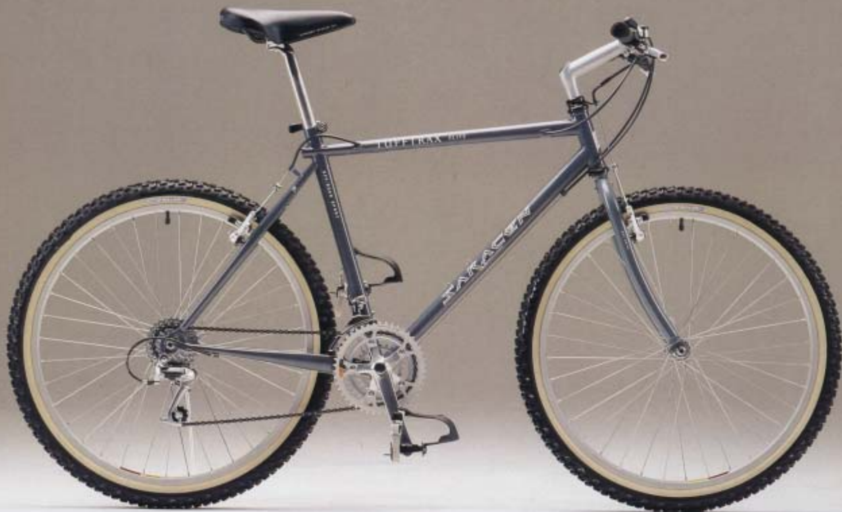
Shimano's New Cartridge Bottom Bracket Set

Shares the Zoom lite stem and lite alloy bars, Ritchey Vantage sport rims and megabite hard drive tyres in common with the Tufftrax. The Tange elliptical frame takes most of the credit for this bike's impressive strength to weight ratio, extra rigidity and reinforcing at major stress points. Upgraded Shimano Deore LX/DX Group Set is also lighter, wears longer and delivers the performance power to defy the elements, the terrain and even gravity.